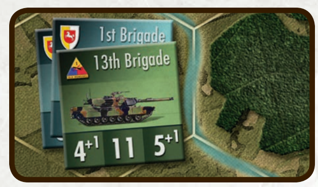
NATO can stack three units per hex.

The NATO player can have up to three units in a hex. The Soviet player can stack three units from the same division or two units from different divisions.